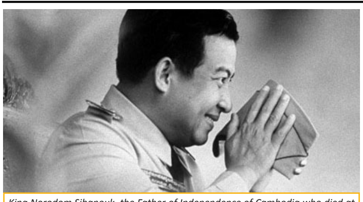
King Norodom Sihanouk, the Father of Independence of Cambodia who died at the age of 90, in Beijing, China.

Vong, S. & Worrell, S. (2012, December 12) Kep first province to wrap land titling scheme. Retrieved from www.phnompenhpost.com/2012121260244/ National/kep-first-province-to-wrap-land-titlingscheme.html