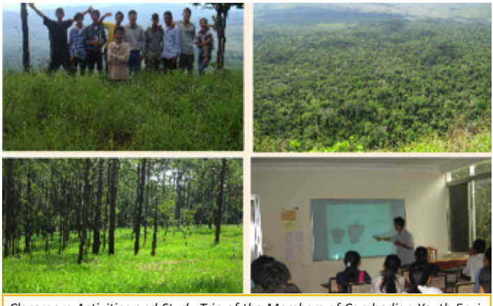
Classroom Activities and Study Trip of the Members of Cambodian Youth Environmental Network

Among the many institutes being established, the Buddhist Academy of PUC has been created with a mission